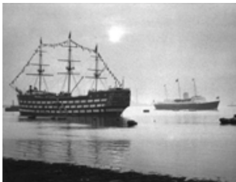
HMV Britannia' passes HMS 'Worcester' (III) after the Royal Tour in 1954.

At over 300' long, the 'Exmouth' - which became the third and last 'Worcester' - was an unusual vessel, since she was built in 1904 of steel and iron especially for nautical training and had many improvements over the converted hulks previously used.