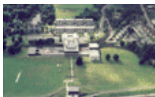
The Merchant Navy College.

The Ingress Abbey estate became the site of the Merchant Navy College, which proved to be an ill-fated venture since it closed within 20 years; in 1999 the palatial buildings were demolished and a vast housing estate is being built on the site. Happily, Ingress Abbey and The Lodge are currently being restored for use as offices.