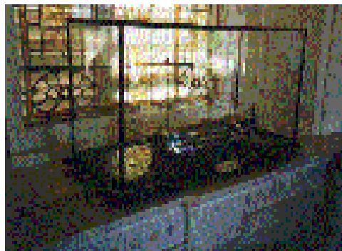
This silver model of HMS 'Worcester' (II) was presented by cadets to Queen Victoria and can still be seen at Osborne House, Isle of Wight.

So the 'Frederick William' changed her name yet again, to become the second 'Worcester' and was moved to Greenhithe in 1877 where she could comfortably accommodate over 150 cadets, though at one time it had been suggested 250 was a suitable figure! For the next 62 years she served her purpose well and many improvements were made over the years. She was eventually connected to the shore for power and water supplies, but the problems of maintaining a ship whose construction had commenced a century before became more and more acute and thoughts were turning to a possible replacement.