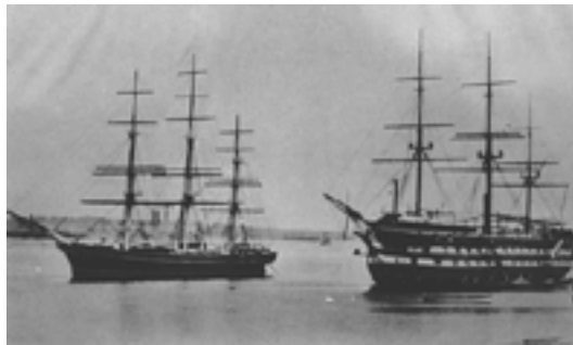
The 'Cutty Sark' alongside HMS 'Worcester' (II).

During the war years, the College was evacuated to nearby Foots Cray Place - see 'History (5)' - and inevitably a shortage of men and materials meant both ships deteriorated badly. The 'Worcester' was used as a training base by the Royal Navy and by 1945 was in a very poor condition, had lost most of her masts and only kept afloat by a large salvage pump. Happily, a replacement for the 'Frederick William' was found in the form of the 'Exmouth' - of which more later - but, following her war service, largely spent at Scapa Flow, she clearly needed all the financial resources and manpower the College could muster to recommission her as a replacement 'Worcester'.