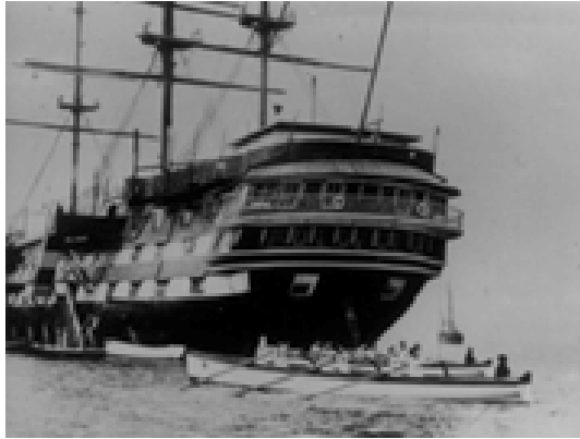
HMS 'Worcester' (II) at the turn of the 20th Century.

Starting with just 18 cadets, the numbers grew rapidly and there was soon a waiting list for entry. Official recognition soon followed - the Board of Trade allowed two years' satisfactory 'Worcester' training to count in part towards a watchkeeping certificate, and in 1867 Queen Victoria instituted a Gold Medal for presentation annually.