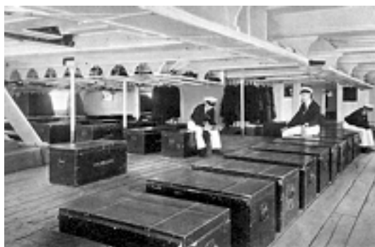
Sea chests used to store the cadets' belongings.

With good headroom, proper classrooms, heating, lighting and staff accommodation she certainly lacked the elegance of her predecessor, but was far more suitable for the purpose. Built by the London County Council to give sea training to boys largely from orphanages, she had been designed to accommodate 750 and the Royal Navy had berthed as many as 600 ratings aboard during the war years - so there was room to spare for the 200-odd 'Worcester' cadets. As with the previous 'Worcester's' most stayed aboard for just over two years, slept in hammocks and kept their belongings in a sea chest. Most left at about 16½ to join the various shipping companies - within a few months many had visited the farthest parts of the world and regularly returned to visit their Old Ship with tales of their adventures. There was a tremendous demand for cadets throughout the late 40s and 50s, but the early 60s saw many changes in the world of shipping and a dramatic fall in numbers at sea - particularly under the British flag.